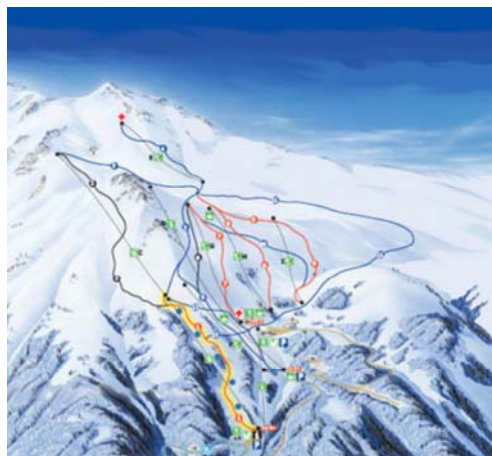
Figure 1: The I*Teach roadmap metaphor

represents a composition of tasks (to be implemented in the context of an active learning environment) leading the students to an educational goal by covering intermediate objectives ( milestones of the learning process). The metaphor behind such a scenario is a path (the process) traced by landmarks (the milestones) leading to the peak (the goal) – Fig. 1.