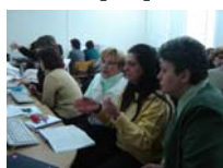
Figure 2. Group discussion and planning

Already in small groups, the teachers were expected to come up with more precise formulation of their topic, to give a proper name of the group, to distribute specific roles among the group-members and to develop and present a plan for addressing that topic (Fig. 2). The group whose sub-theme was Learning provoked by individual interests chose games as a more concrete topic to work on and called themselves Student-ludens (student as player) by analogy with Homo Ludens [10].