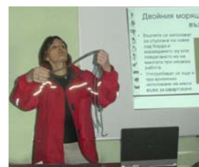
Figure 4: Presenting sailing knots