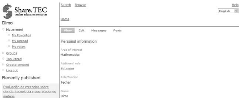
Fig. 1. Share.TEC main menu screenshot.

Fig. 1 shows also the user information screen, which gives the possibility to view and change or create personal information, messages and posts. As can be seen from the screenshot the interface layout is well organized and suggests easy and intuitional work with the system. Recommendations associated with this screenshot and the system as a whole, include the possibility of changing the color scheme for the user interface. It is true that the colors are the adequately chosen in order to assure easily to read and distinguishable words. But there is no doubt that a common option like changing of interface layout and colors in order to suit the user's preferences would lever up the desirability towards the repository system's interface.