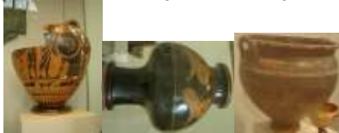
Fig. 4. The challenge of restoring ancient vessels

The implementation of these ideas is best achieved in the textbook for 7 th grade, the red thread being the theme of coding. The grand finale is a project requiring the students to put together all the subject knowledge and skills acquired during the school year and to work creatively in teams for the achievement of a common goal. During the project the students are faced with problems from real life and are expected to understand in a natural way when, how and which ICT tools to apply so as to solve the challenge of restoring archeological artifacts (Fig. 4).