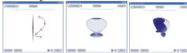
Fig. 5. The computer model developed on the basis of an Elica [11] application

For the purpose students are encouraged to explore computer models (Fig. 5) and to decode a message (Fig. 6) with hieroglyphs so as to help a local museum to restore ancient Greek vessels and guess their function.