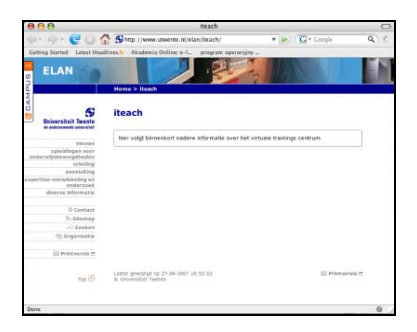
Picture 6. I*Teach VTC Netherlands http://www.utwente.nl/elan/iteach/