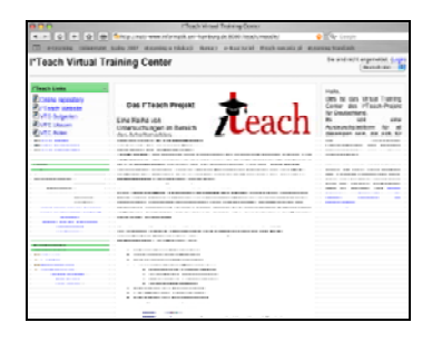
Picture 3. I*Teach VTC Germany http://nats-www.informatik.uni-hamburg.de:8080/iteach/moodle/