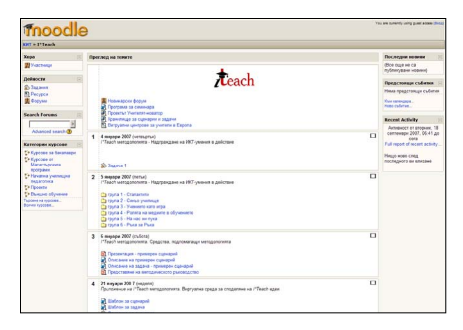
Picture 10. I*Teach VTC Bulgaria - one course http://e-learning.fmi.uni-sofia.bg/moodle/course/view.php?id=80

Additional to these, teachers can use VTC as database for searching of partners for their further works at school.