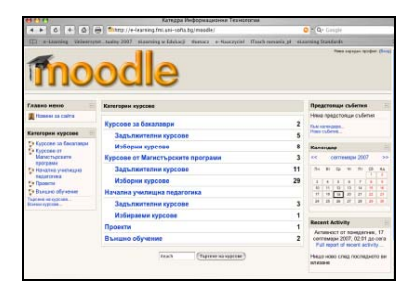
Picture 2. I*Teach VTC Bulgaria http://e-learning.fmi.uni-sofia.bg/moodle

project allowed teachers to be presented with selected ICT tools and the basics of e-learning. Moodle constitutes a very flexible platform which makes it possible to prepare training courses. In addition to this, no particular programming skills are required to create such courses. Only basic ICT skills are essential to prepare a course.