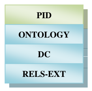
Fig. 2. Digital object structure for OWL classes

The structure of digital objects in Fedora for representation of OWL classes is shown on Fig. 2. All objects have content model onto-CM:Class which defines the datastreams in the objects.