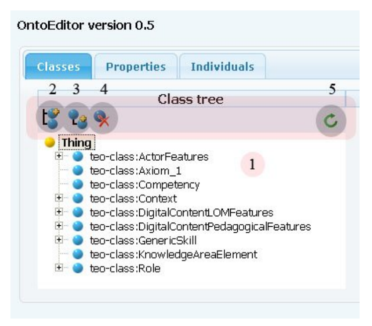
Fig.3. User interface of OntoEditor

We have developed the following classes in PHP that are used by the editor: