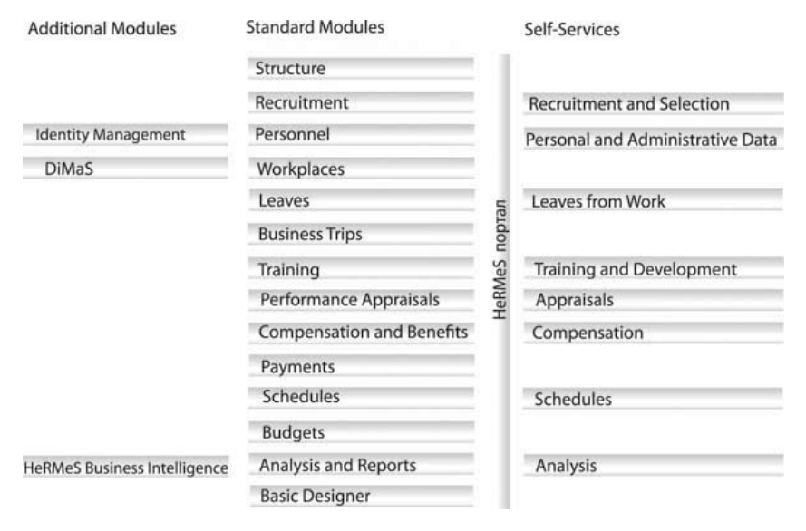
Fig. 2. Modules in HeRMeS V.

The three groups of modules are available to employees of the organisation. However, some processes require the system to be accessed by persons who are not employees of the organisation, e.g. a person applying for a job vacancy. The HeRMeS V portal ensures bringing together all HRM activities supported by the system which require interaction of non-employees.