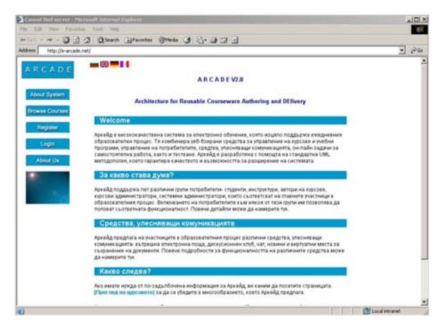
Figure 2. ARCADE – a Learning Management System developed as a team work of four MSc students

The SE Master education at FMI is based on team work on class projects which are supposed to produce useful tools which are supposed to enrich either the software environment at the work place of the students or the SE educational environment. The students are involved in development, maintenance and refinement of real software that helps the students better understand the subject and adapt to a team work style. Some of the projects the students work on come from the research areas of the professors, and they might eventually evolve into diploma thesis. In some cases such project matures towards a PhD thesis as well. In other cases projects came from the current internal university needs. An example of such project is the eLearning Management System ARCADE [7], which was developed on a basis of team work of a team of four MSc students lead by a university professor. This system has been used as an eLearning platform for delivery courses at MSc level for more than six years now. The systems have been gradually extended and enriched with new functionalities and services and it was used as a basis for additional five MSc and two PhD works.